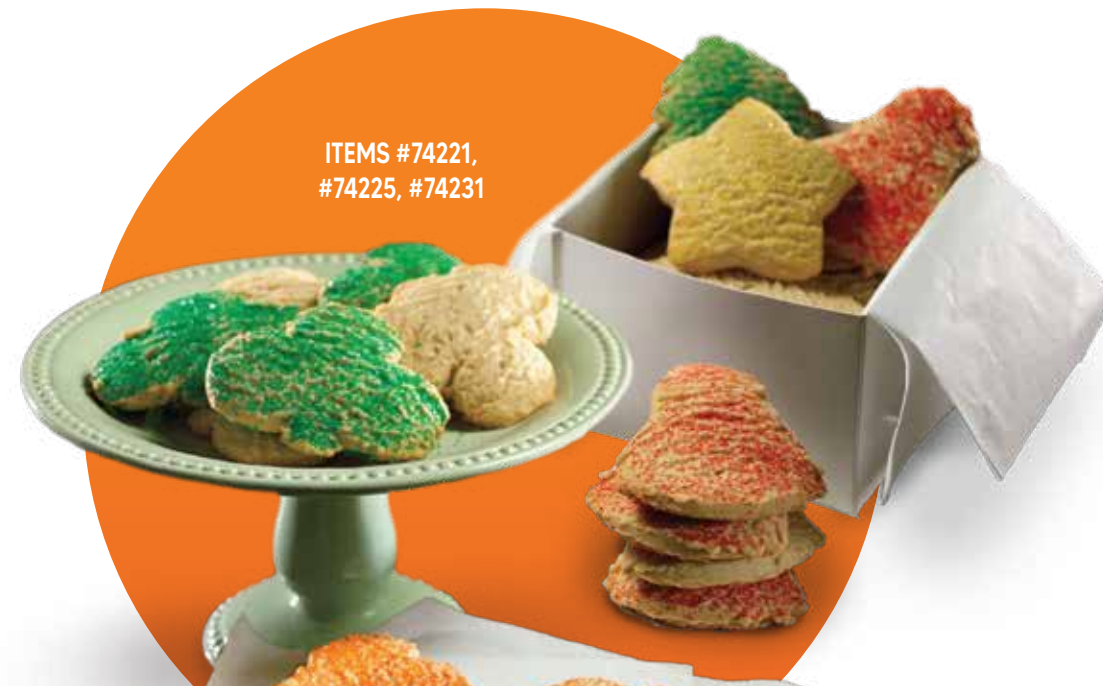
ITEMS #74221, #74225, #74231