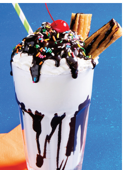
Churros make milkshakes extra special

Start serving fun and profitable products from J&J SNACK FOODS Contact your representative and learn more at jjsnackfoodservice.com .