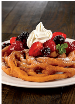
Funnel cakes with fresh fruit and whipped cream for breakfast

READY FOR YOUR NEXT GREAT LTO? Consumer preferred solutions!