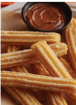
Churros with chocolate dipping sauce makes a great snack