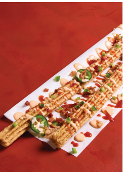
Drizzled savory churros make a great snack