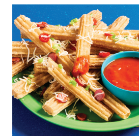
Unique and sharable