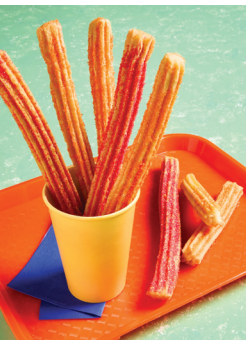
Serve churros with flavored sugars