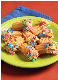
Coat churros in cereals for a unique breakfast or dessert