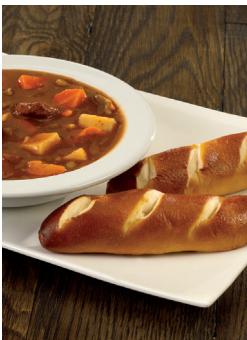
Mini pretzel sticks make a great side to any entrée