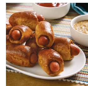
Adds fun to your bar