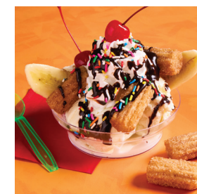
Pairs great with ice cream