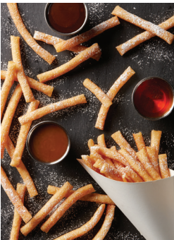
Serve funnel cake fries with signature dips and sauces