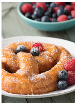
Soft pretzel french toast makes an exciting breakfast or brunch