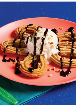
Churros with ice cream and a chocolate drizzle