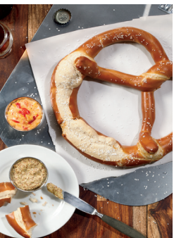
Brauhaus pretzels with specialty cheeses and mustards