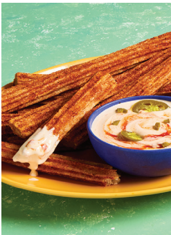
Serve churros with spicy salts and queso