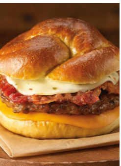
Pretzel buns add novelty to breakfast sandwiches