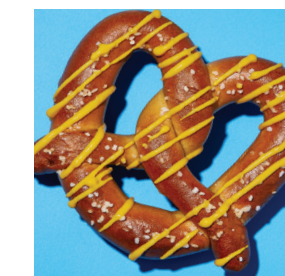
Classic and craveable