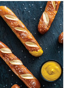
Serve pretzels sticks with signature mustards